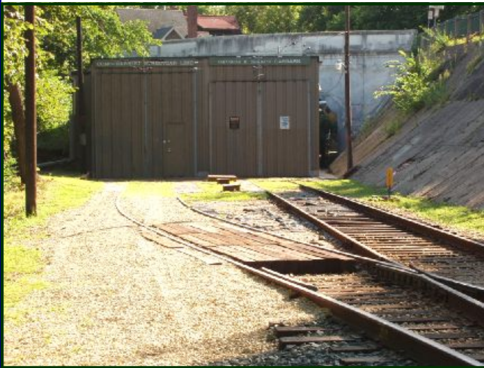
This photo shows the new “crossing” over the Isaacs car barn maintenance barn lead track. Now delivery trucks and automobiles can cross over the rails and snuggle right up to the car barn door without tearing up a tire or two.