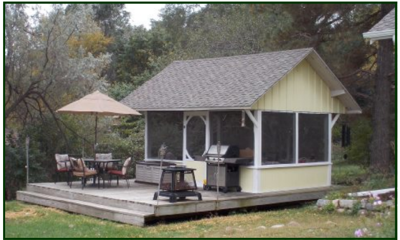
(Above left) Here's the Hopkins shelter located at 9th Avenue, ca. 1915. That's the Minneapolis-Moline factory in the background. (Above right) The former Clear Springs shelter is now used as a backyard recreation building.