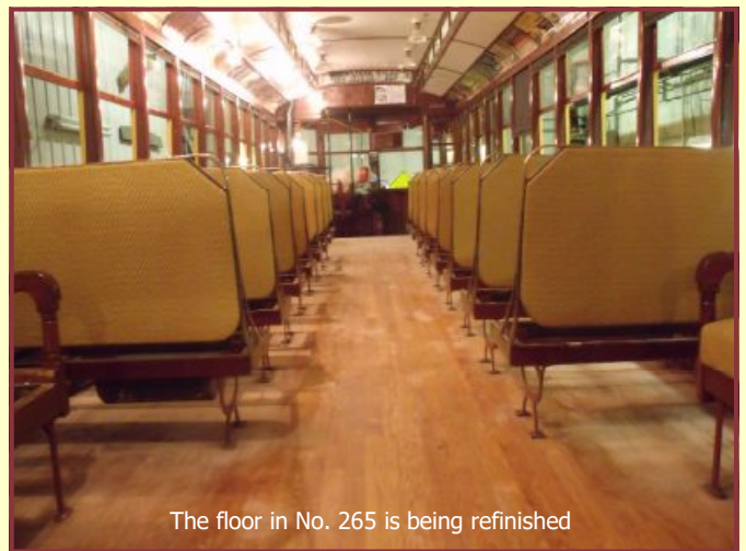
The floor in No. 265 is being refinished