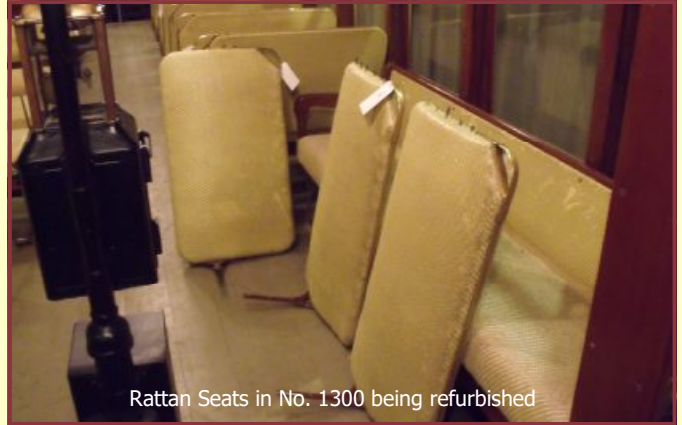
Rattan Seats in No. 1300 being refurnished