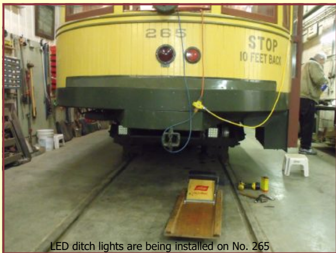
LED ditch lights are being installed on No. 265