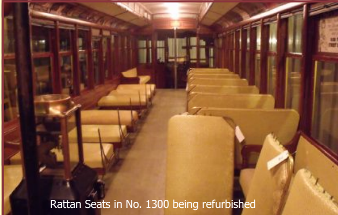
Rattan Seats in No. 1300 being refurnished

The 2015 operating season is over and our Operating personnel are enjoying a well-deserved rest. As reported elsewhere in this newsletter, our 2015 season was a good one and ended on a very positive note with our very successful holiday special events. Now it's time to take a break—unless you also volunteer in our George Isaacs car barn and shop or the Excelsior car barn and restoration shop. In these Museum facilities, activity actually picks-up during the winter months when we don't operate. Our historic streetcars are old with all except one of them (PCC No. 322) 100-years old or older. So, our historic cars need constant maintenance to keep them mechanically sound and, more importantly, safe for our passengers and volunteers. The photos below depict just some of the things that are going on in the Isaacs shop this winter. The photos on page 5 depict some of the activities surrounding the restoration of Winona No. 10.