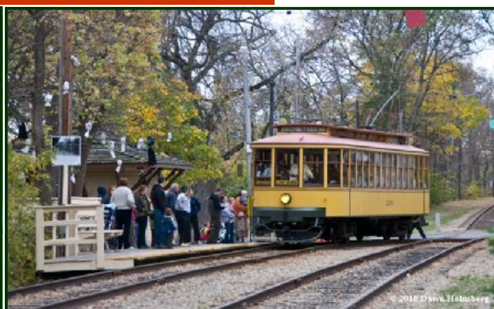
(Above Left) TCRT No. 1300 is pushing a trailer loaded to the brim with pumpkins. (Above Right) TCRT No. 1300 pulling up to the Linden Hills station platform with waiting passengers eager to board. Note the platform's decorations courtesy of Karl Jones .