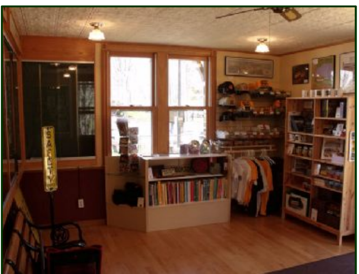
Here's a photo of the south wall of the Linden Hills station. The empty display cabinet on the left won't be empty for very long. Museum Historian, Mike Buck is preparing a special display that will go inside this cabinet to celebrate the 40<sup>th</sup> anniversary of our Museum.