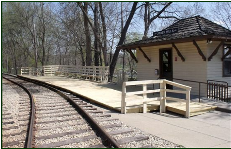
Here's the finished platform on May 7<sup>th</sup>. Benches are in place and everything is ready for the first passengers of the 2011 operating season. What a big improvement!