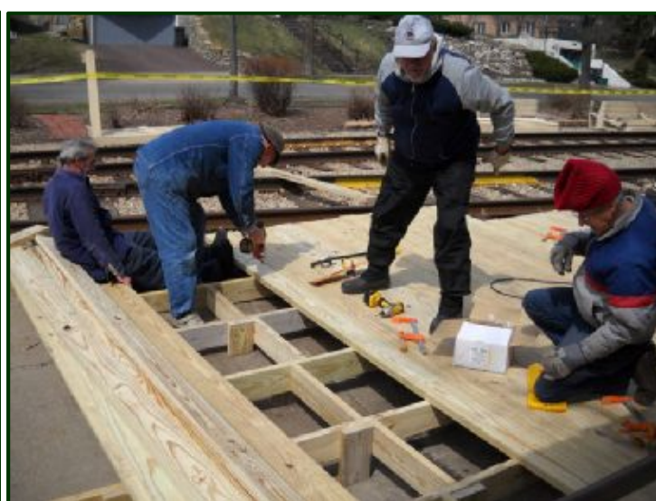
(Top Left) The new floor support joists are now being installed. Some of the old wood still can be seen in the foreground but this old wood will be removed very soon. The leaves and junk has also been cleaned out using a leaf blower. (Top Right) Here's a view of the platform foundation looking towards the south. Note that the platform's foundation is made up of railroad ties. (Bottom Left) The treated wood floor boards are being laid out along the new platform.

(Bottom Right) The nailing crew has begun their work. We used galvanized screw-nails to make sure the boards stay down. Using common nails would mean that some would eventually work their way out of the wood and become a tripping hazard.