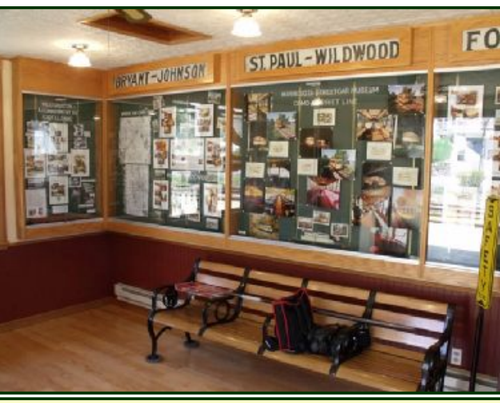
This photo shows the northeast corner and most of the east wall of the station's interior.