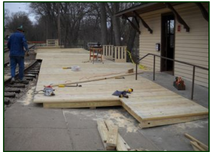
The platform is about 95% finished. Some trimming of the boards needs to be done and the benches re-installed. The volunteers who did the work did a superb job. If you see one or more them please give them a big thank you.

(Bottom Right) The nailing crew has begun their work. We used galvanized screw-nails to make sure the boards stay down. Using common nails would mean that some would eventually work their way out of the wood and become a tripping hazard.