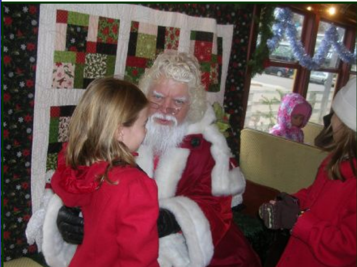
As reported on page 3 of this issue, ESL's North Pole trolley was a huge success, carrying over 1,300 passengers on the three days after Thanksgiving. Here we see Santa doing what he does best—making boys and girls (and moms) smile and dream.