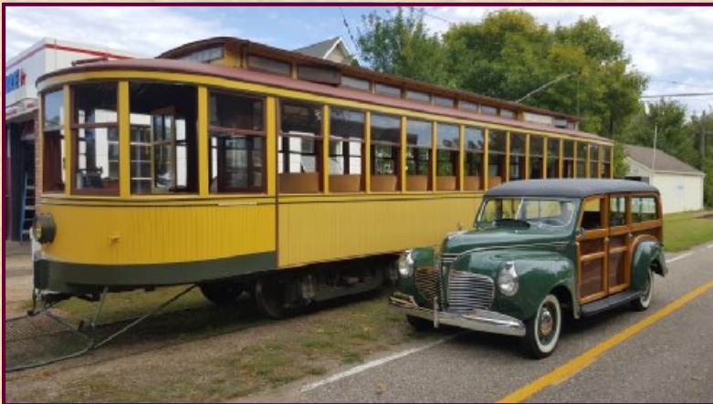
(Above Left & Right) TCRT No. 1239 and the ticket booth at the Water Street platform in Excelsior were decorated for ESL's special streetcar operations scheduled in conjunction with the Ryder Cup golf tournament, held in the near-by town of Chaska, Minnesota. While the rider count didn't match our anticipations, our involvement did send a message that we are a part of the community and are willing to participate in these kinds of events.