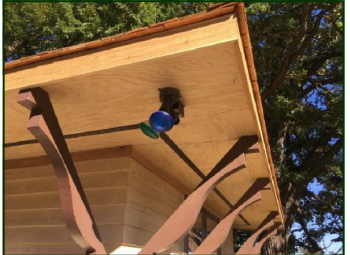
The above two photos shows in-progress work on the repairs to the Linden Hills station.