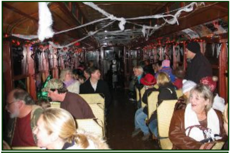
Something interesting is going on the left outside of car No. 1239. It can't be too scary judging from the smiles on the passengers' faces.