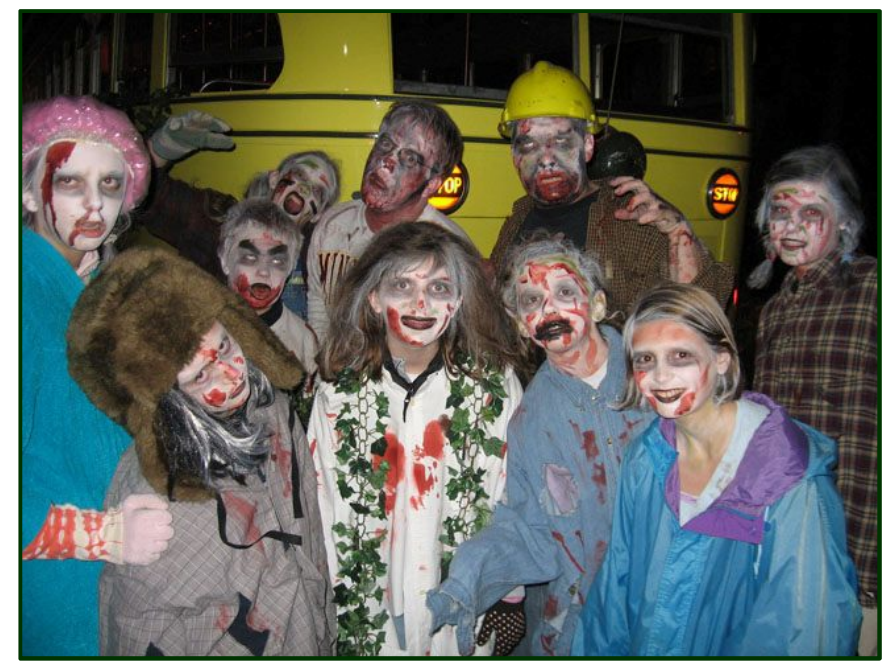
( Left) Here's a sweet young lady just waiting to scare the wits out of our passengers. ( Right) On another night we had these zombies who did a great job entertaining our passengers.