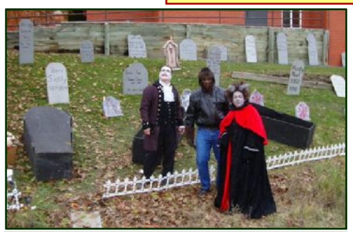
The Excelsior ghost trolley had a series of scenes/skits along the half-mile line. Here are three well made-up people in the "graveyard" across from the carbarn.