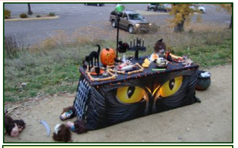
At the east end of the Excelsior Streetcar Line was a small table selling body parts, black cats and other Halloween paraphernalia. Eye of newt, anyone?