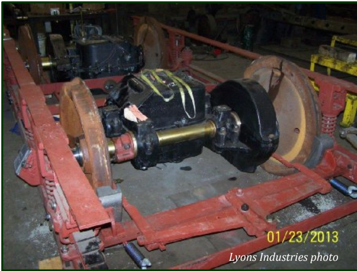
Winona No. 10's truck has been worked on for over a year. Here's a photo taken in January 2013 showing the progress made up to that point. In January we needed to find a small air compressor. We found one and it has now been mounted on the truck.