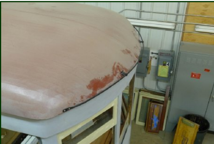
Major and minor hardware are gradually being put back on Winona No. 10. Here we see the rub rail has just been put on the front of the platform roof. This piece prevents the trolley rope from rubbing the edge of the roof and wearing away the paint and canvas roof material.