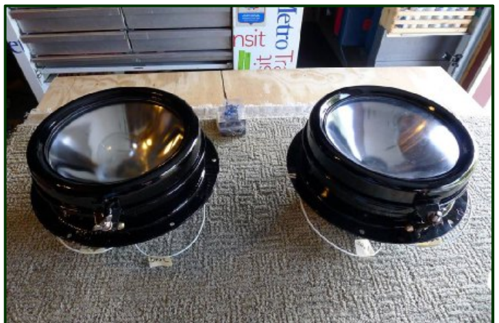
Howie Melco completely refurbished and repainted Winona No. 10's two headlights.