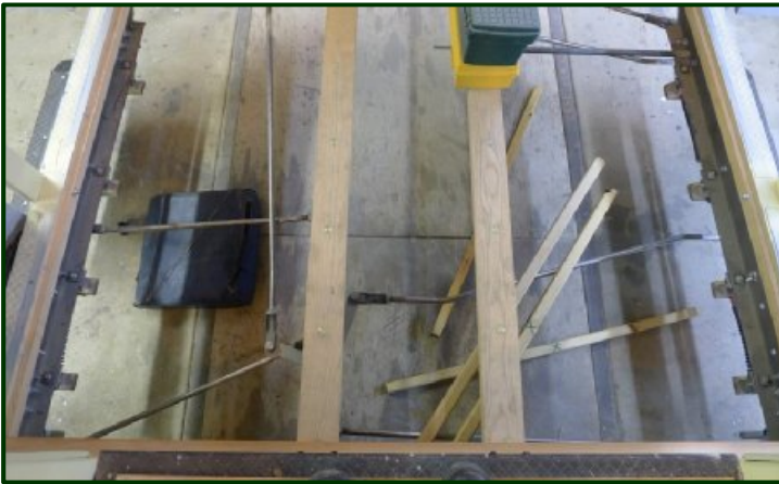
The steel rods you see are the linkages between the door control handles on the platform and the doors and steps. Winona No. 10 was a no frills streetcar—when delivered in 1914, nothing in the car was operated by air or electric motors other than the traction motors. Doors were hand operated. In fact when the car was first operated in Winona in 1914, the car didn't have air brakes, just hand brakes! Air brakes were installed within a year or so, however, as the car was too heavy for hand brakes.

In a nutshell, No. 10 is now being put back together again. All the woodwork, paneling, etc., removed from the streetcar in the early 2000s are now being put back in the spot from which they were removed. Where the wood was beyond being restored or refinished, new materials are being put in. It is also reported that the single truck that has been worked on at the shop in Pennsylvania is now finished and arrangements will soon be made to bring it to Excelsior. After the carbody is mounted on the truck, the electrical work will begin. Note the nicely finished trim and panels now being put back on this rare streetcar.