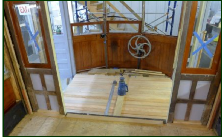
The platform floor is now being installed. The shaft seen in front of the left window post controls the two doors on the right. The doors on the left were not controlled from inside the streetcar and actually one of them was permanently fixed closed when the car was new. Within a short time both doors opposite the regular entry/exit doors to the right of the Motorman were permanently closed.