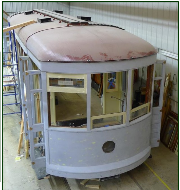
Roof appurtenances and route/destination sign box are installed.