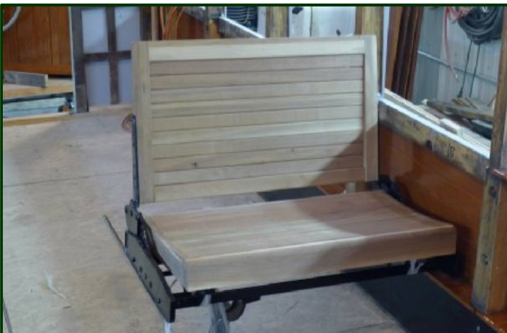
One of the walkover (flip over) seats was placed temporarily in the car just to see how it fits. The seat still needs stain and varnish.