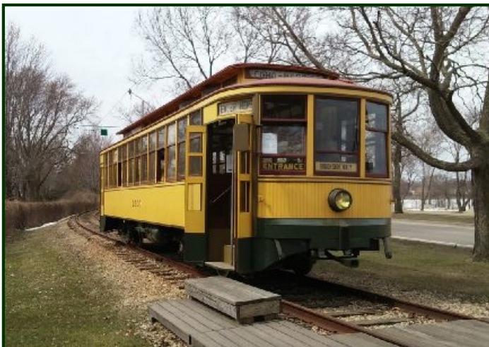
TCRT No. 1300 has been making test runs at CHSL but is not yet ready to enter regular service.