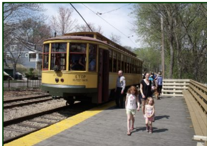
Over at CHSL good loads of passengers visited on the first day of the season, until the rain and thunder cut short the day's operation at 6 PM.