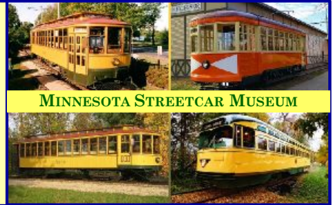
MINNESOTA STREETCAR MUSEUM