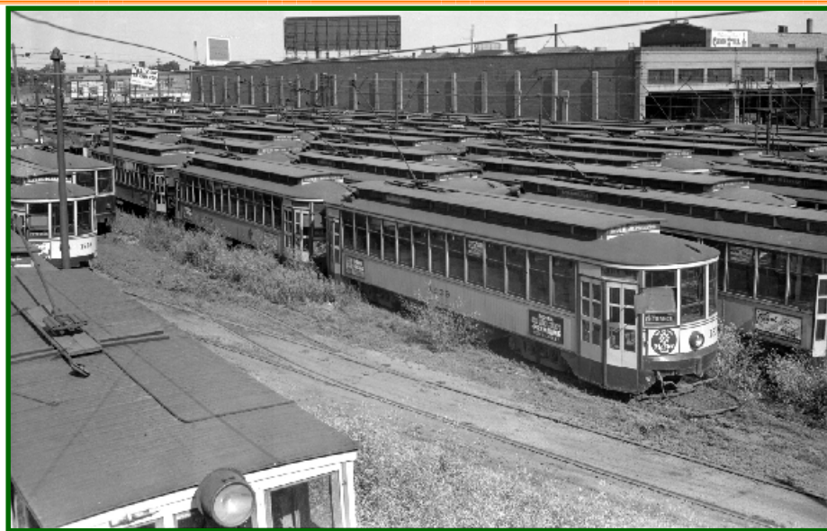
Taken probably sometime in early 1953 this photo shows our No. 1239 awaiting its fate along with at least 100 other cars in the Snelling Station's yard. In a few weeks or months, No. 1239 will be sold for use as a cabin on a lake in Long Lake, Minnesota. Note that the car looks like No. 1300. When our Museum restored the car in 2000-2004, it was restored to it's 1907 configuration with the wire gates in the rear and the motorman's door in the front.