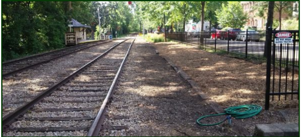
(Above) The Linden Hills station garden is now cleaned up and the irrigation system working. Next spring new plants and flowers will be planted in this area.