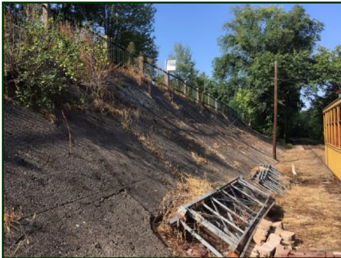
This is a "before" photo showing the state of the car barn concrete retaining wall partially cleaned-up.