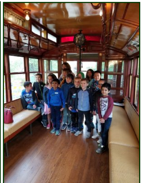
An Excelsior Elementary School group poses inside No. 1239.