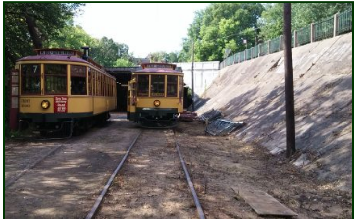
This "after" photo shows how much better the retaining wall looks after intense and hard work to cut the weeds and brush away and treat the roots so they don't grow back.