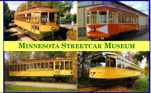
MINNESOTA STREETCAR MUSEUM