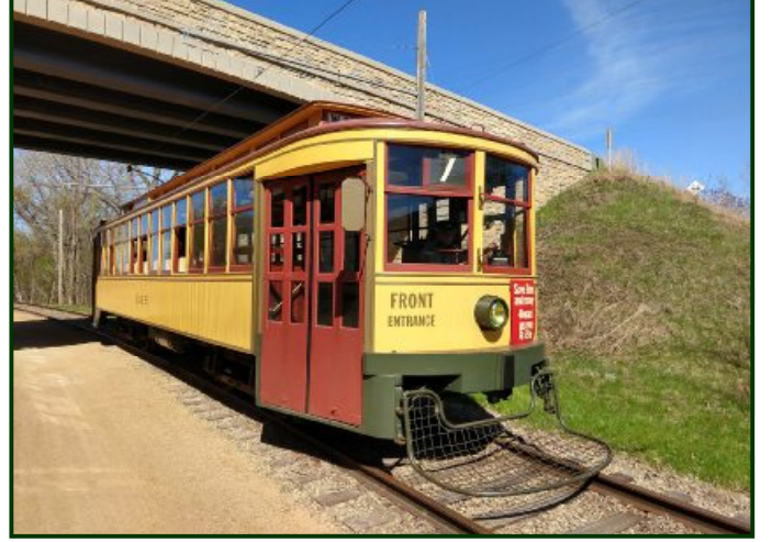
No. 265 is under the Excelsior "flyover" hiway bridge. This bridge replaced the original Twin City Rapid Transit bridge which carried the high-speed cars over the Minneapolis & St. Louis RR right-of-way.