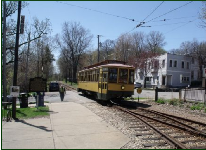
On May 4, 2019 No. 1300 is shown crossing W. 42nd Street ready for the first run of the day.