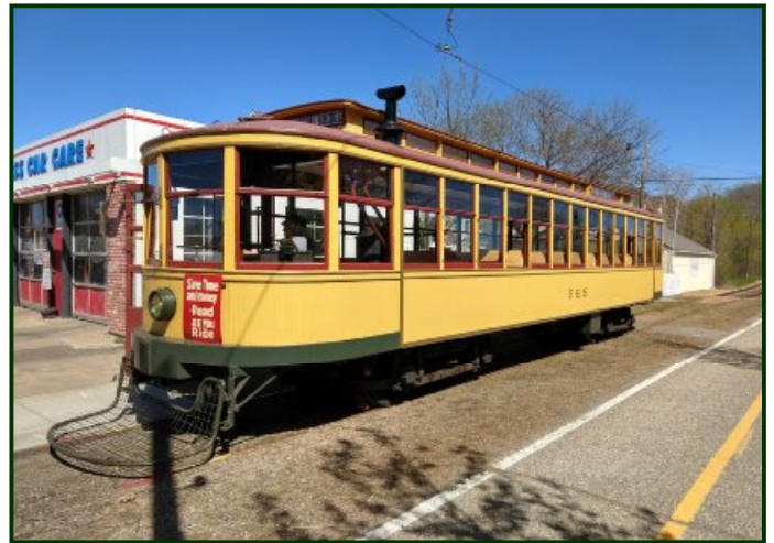
Here we see Duluth No. 265 at ESL's Water St. platform. No. 265 had the first day honors.