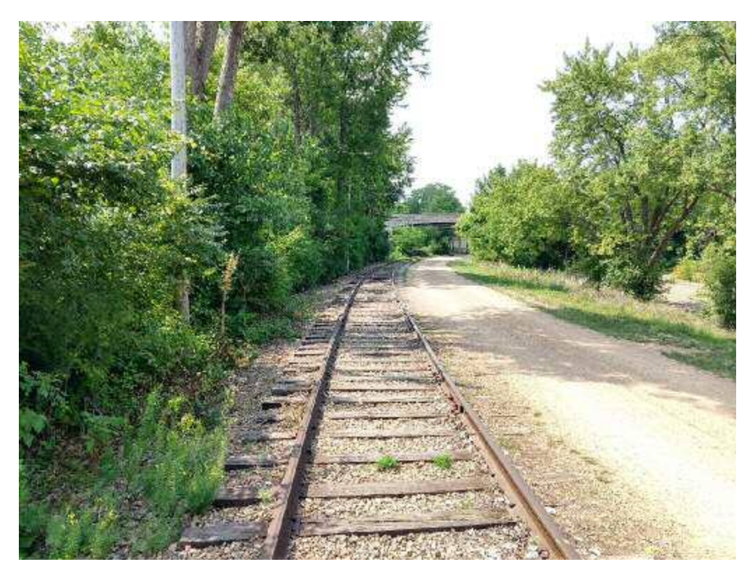
Hidden Pestdestrian Path - Westbound