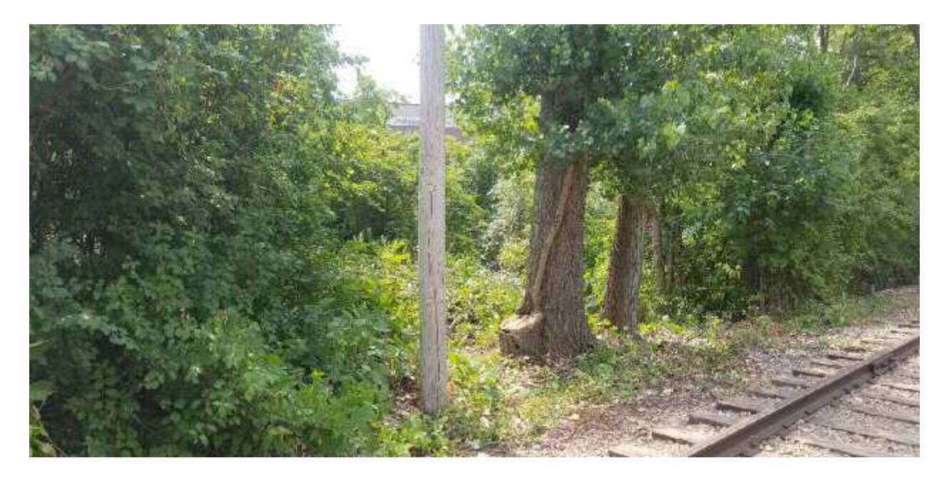
Pedestrian Path After Brush Clearing