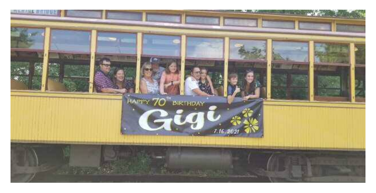
ESL Birthday Charters