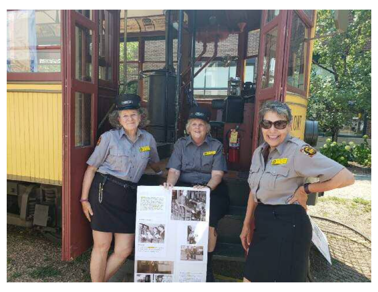
Return of the Motorettes