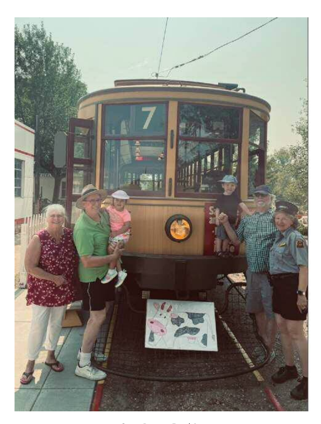
Crazy Days at Excelsior