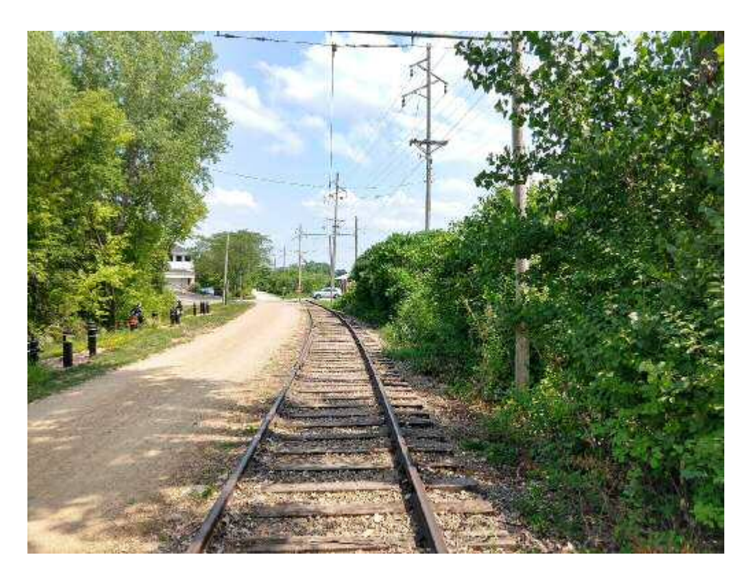
Hidden Pedestrian Path – Eastbound