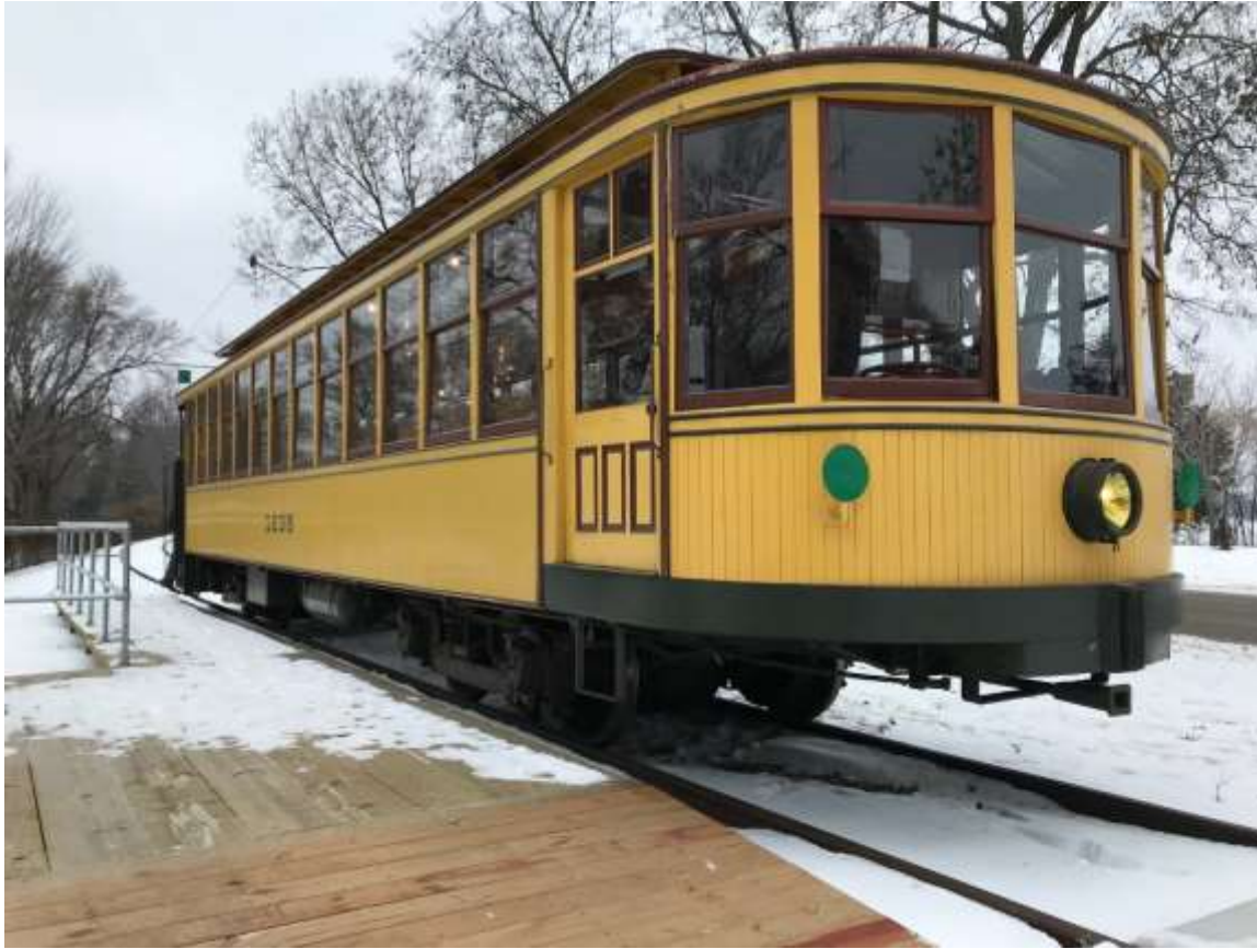
TCRT 1239 Returns to CHSL for truck replacement