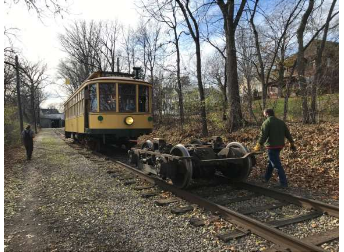
1239 moves to ready barn track, towing its former front truck. At a minimum it will donate journal boxes; further disposition tbd.