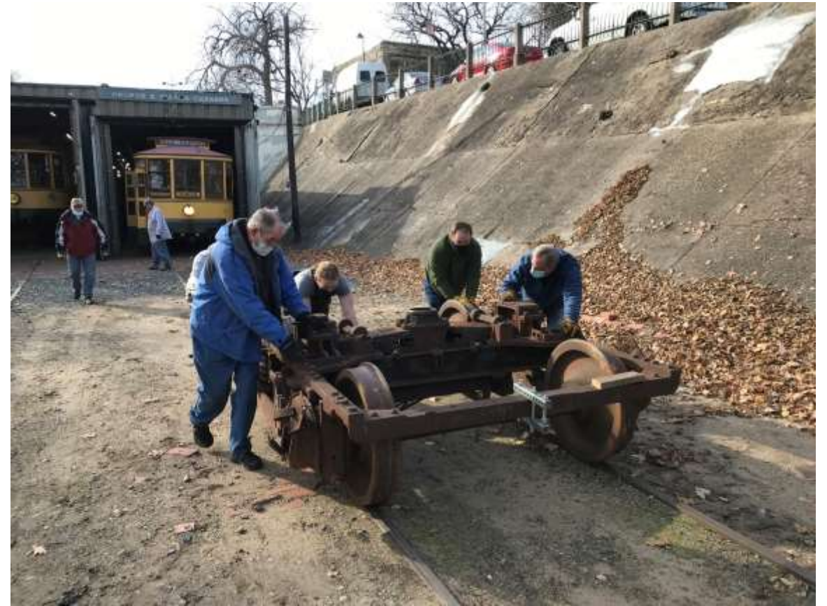
IRM truck being pushed manually beyond south switch. One journal bearing was missing, replaced with shaped wood.