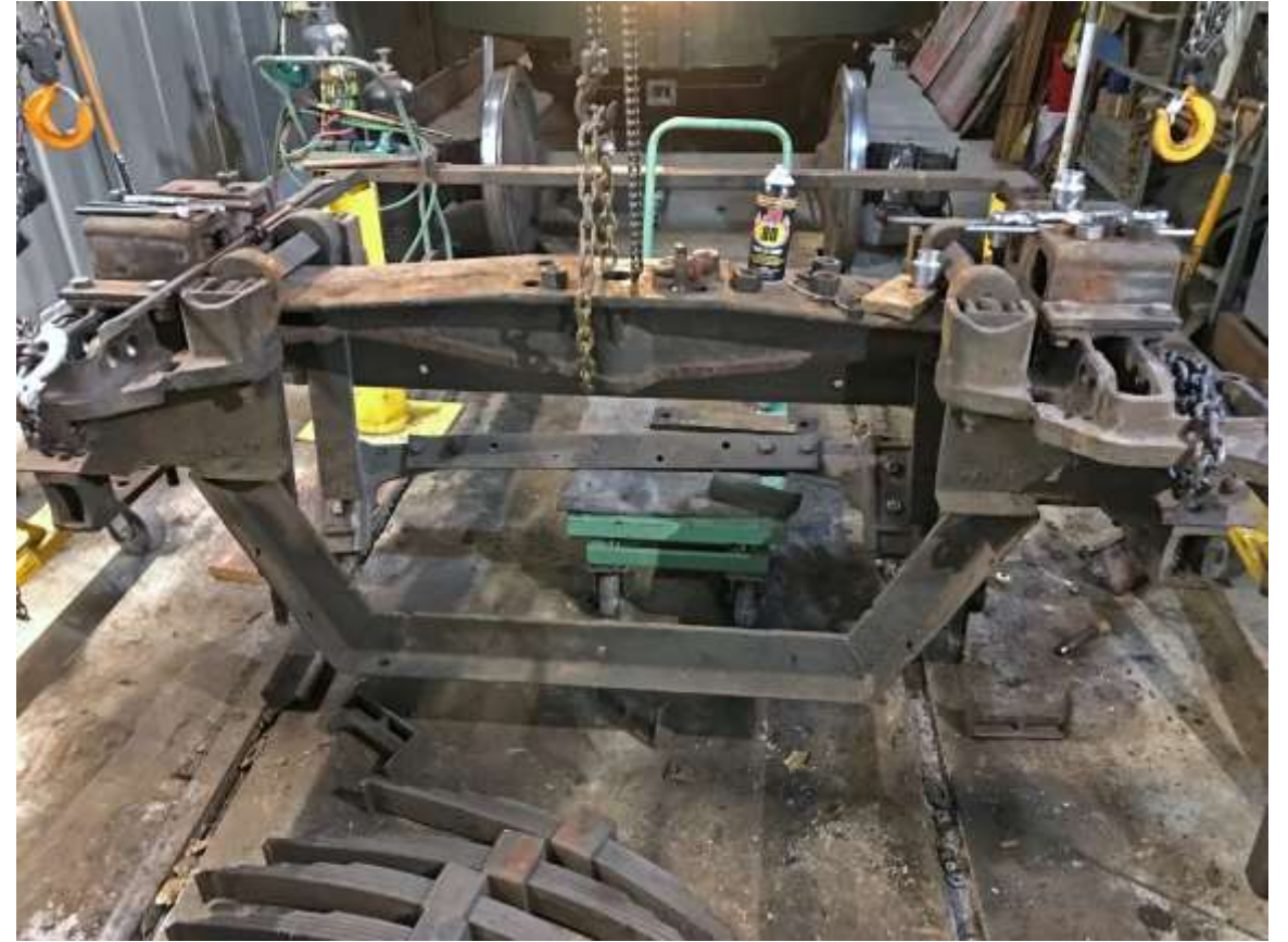
Dismantled truck viewed from motor bay. Pedestal/frame bolt holes are reamed to fit and difficult to disassemble.