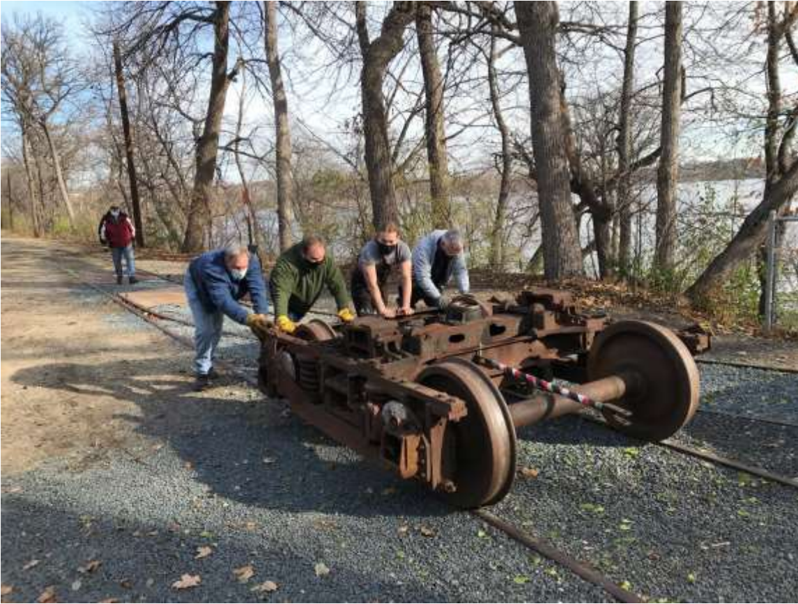
Mangels, Franske, Trockman & Jones move IRM truck to maintenance barn track for installation under waiting 1239