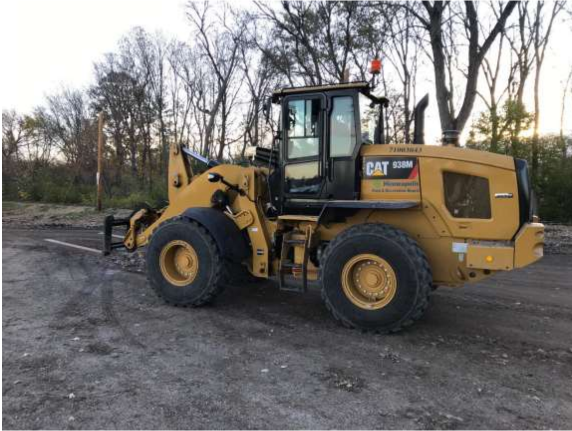
Park Board wheel loader at Richfield Road