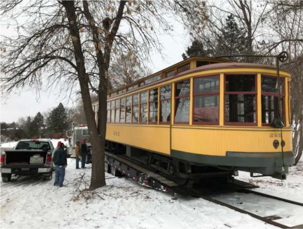
DSL 265 loaded at Lakewood Cemetery for transport to ESL. Howie Melco and Aaron Isaacs visible.