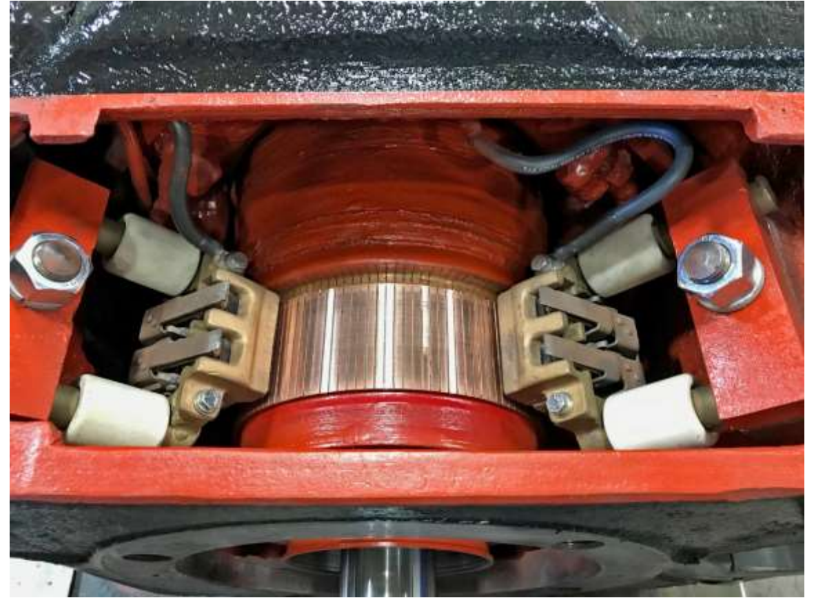
Armature end of GE Canada 241B motor rebuilt at L&S.