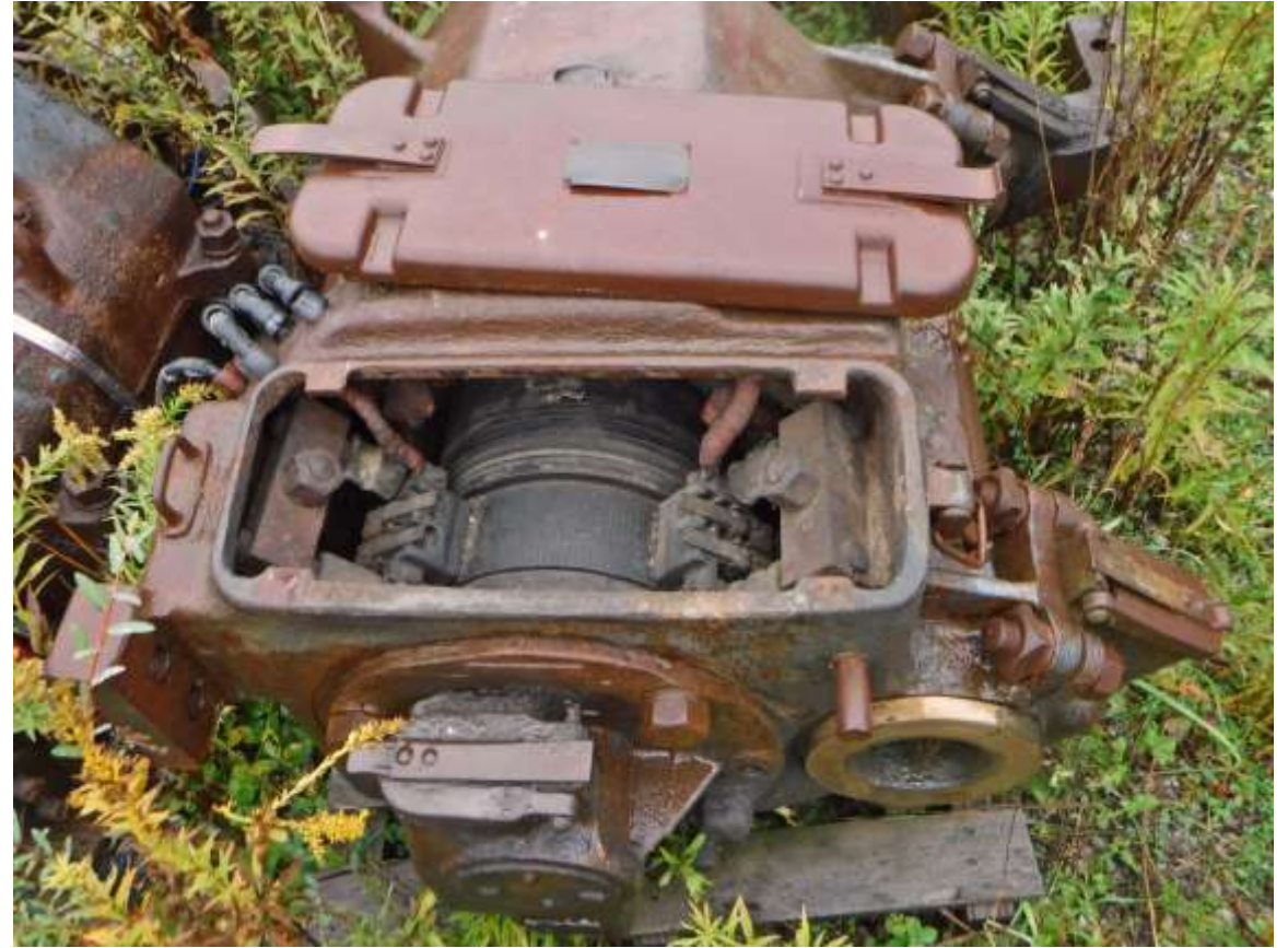
Typical condition at armature end of GE Canada 241B motors.