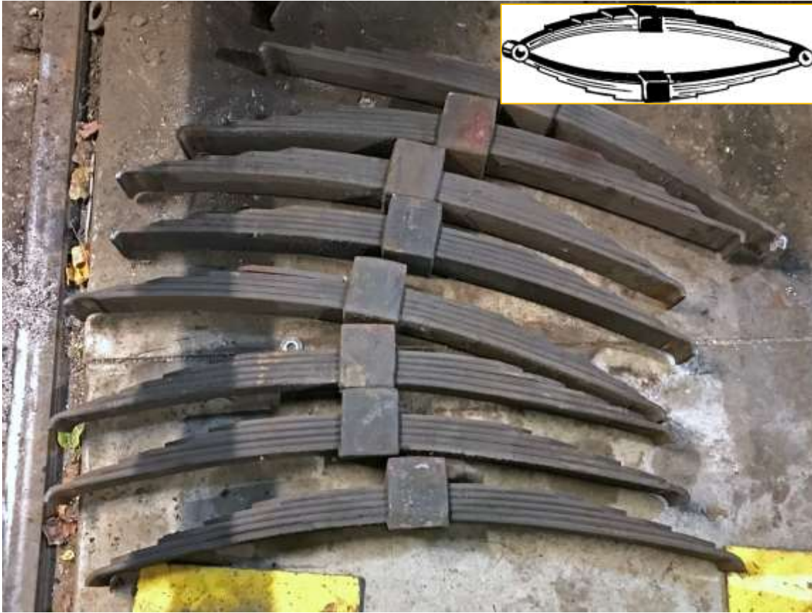
Leaf spring bundles are paired, concave sides face-to-face, yielding four full elliptic springs per truck.