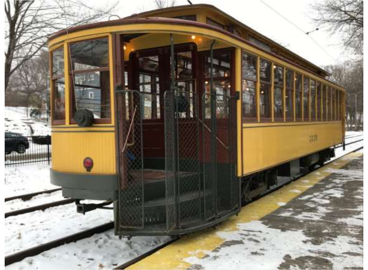
Checking gate car clearance at depot platform