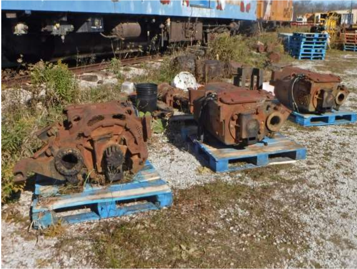
Three of five GE Canada 241B motors purchased from Halton County Radial Railway near Toronto. Note helical pinion gear.