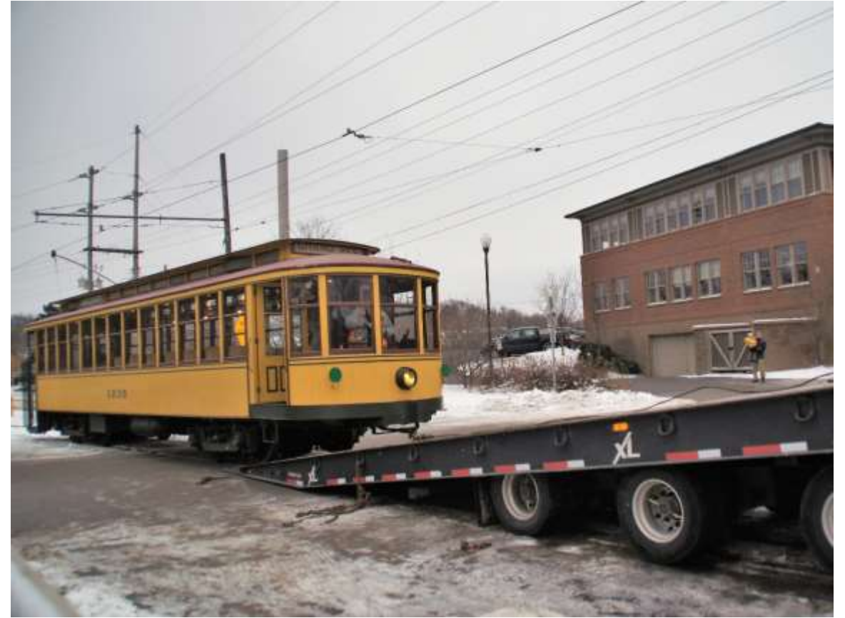
TCRT 1239 loading at ESL, destined for CHSL (photographer unknown)