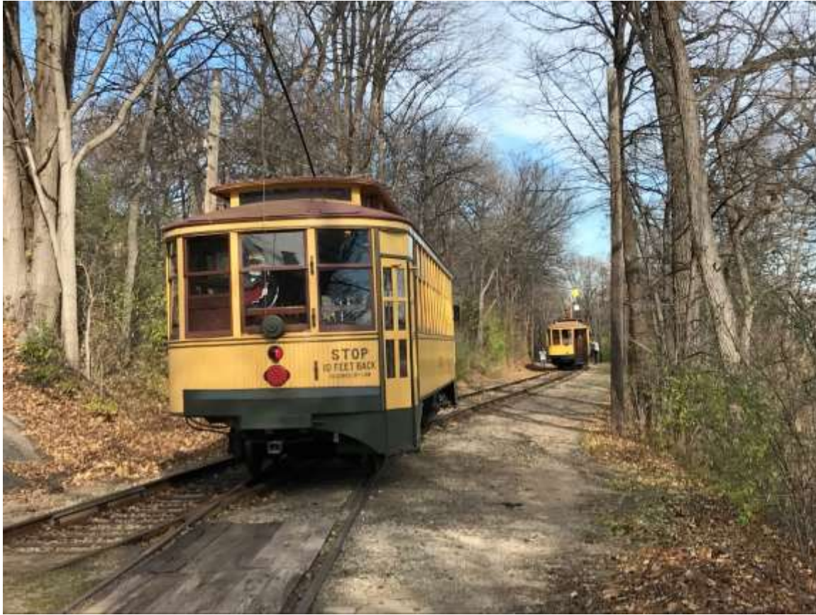
Car 1300 moves to maintenance barn track. 1239 with unpowered front shop truck waits in the distance, powered by rear truck.