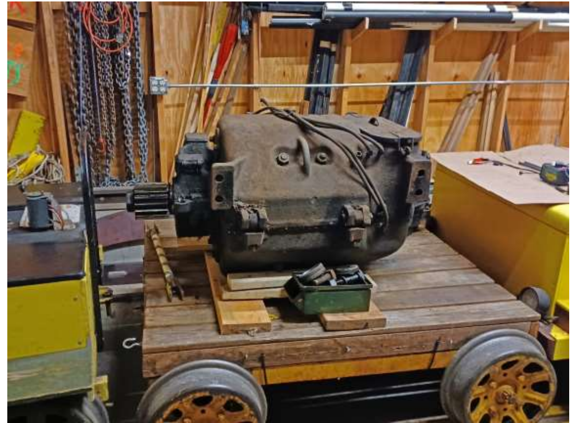
Surplus GE 57 motor from 1239 lead truck. Replacement truck will be powered by two GE Canada 241B motors. (K. Jones)