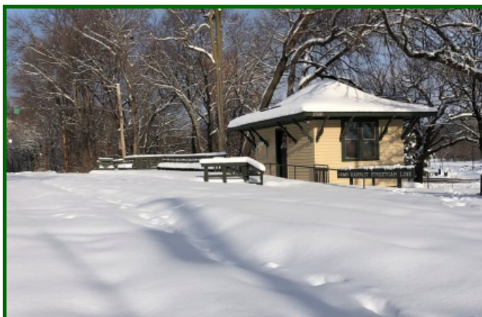
Right now, it isn't easy to reach the Linden Hills station on the Como-Harriet Streetcar Line. That doesn't matter a lot with streetcars snug in their barn for the winter. But just because the station is closed doesn't mean you can't browse and buy unique streetcar books and merchandise. Our online store is always open. Check it out at TrolleyRide.org/store . (Caption & photo by Bill Arends)