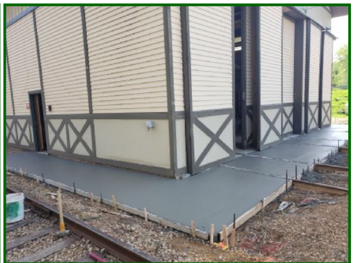
The concrete work at ESL's car barn is finished. It really improves the footing and drainage.