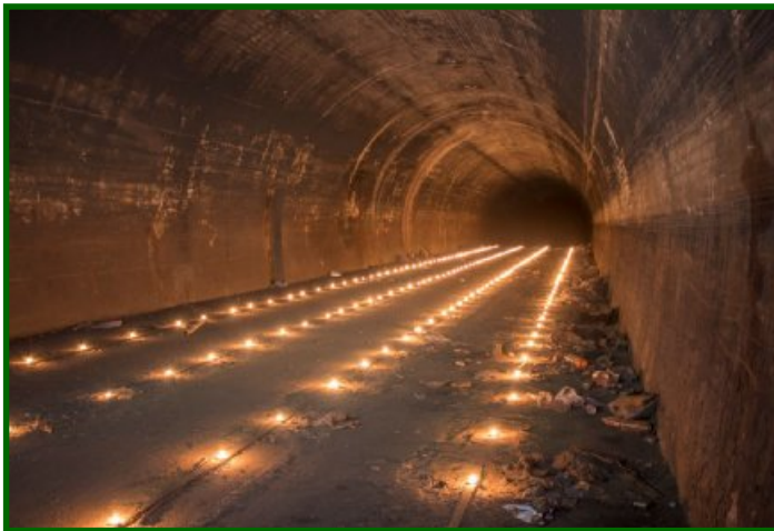
Selby Tunnel in St. Paul. Normally not seen but in this photo we can see the lights placed on top of the running rails.