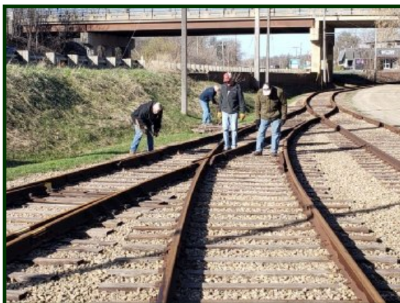
Excelsior Prepares For The 2023 Season

Finally, I would like to thank all of those returning volunteers in advance for their time and effort. If you can, please try and operate once or twice a month. There are only 395 shifts remaining open in the 2023 season. Have fun. Be safe. ☺