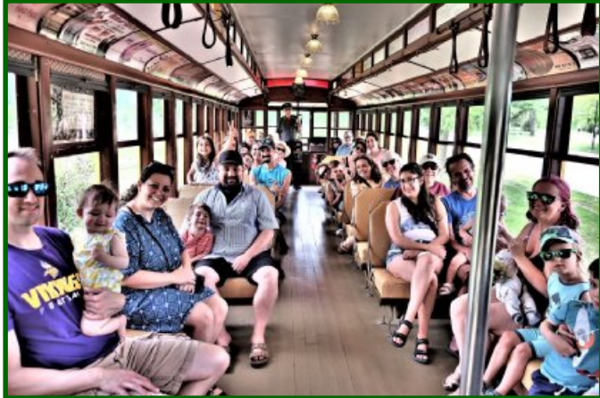
Memorial Day 2023 witnessed TCRT No. 1300 running at near full capacity. Looks like a happy crowd, eh?