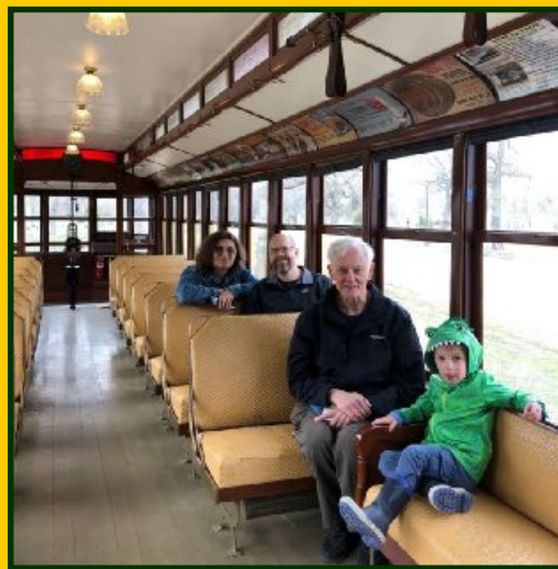
The weather on April 29th wasn't optimum to say the least. It was cold and damp. But not bad enough to curtail or cancel our first day's operations for 2023.