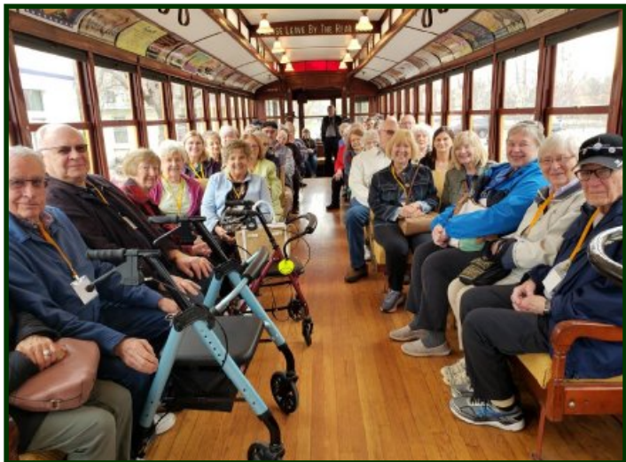
First charter of the season at ESL featured a "mystery destination" trip for a senior citizens group