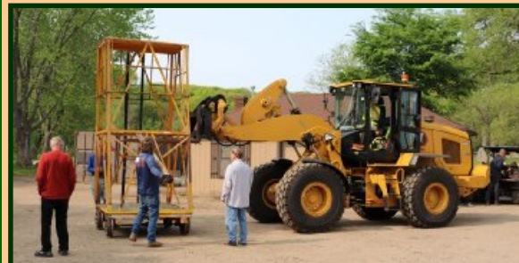
After the tower wagon was derailed and moved in the Park Board's maintenance area at Bde Maka Ska, a heavy-duty forklift was used to lift the tower wagon on to the transporting trailer.

We have been using a home-built tower wagon at CHSL for at least the last 45-plus years. As previously reported in this newsletter, our shop forces have built a new and improved one and the old tower wagon became surplus. We offered it to other streetcar museums and the National Capitol Trolley Museum in Maryland just north of the District of Columbia border said they wanted it. A truck came by a couple of weeks ago and hauled it off to its new home. Here are a few photos of the loading-out onto the trailer.