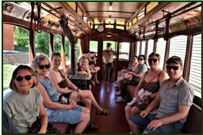
A happy bunch of passengers at ESL enjoying a ride on Duluth No. 78. No. 78 was built in 1893, restored in the 1980s and is one of the oldest operating streetcars in the US.