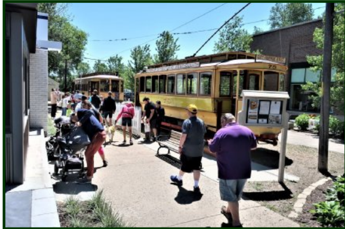
June 11th was Art On The Lake festival in Excelsior. And the people came out on a beautiful day to ride our streetcars.