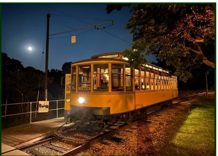
There's something about a streetcar operating at night that's magical! Here's TCRT No. 1300 at the Linden Hills station (left) and at the north end platform during CHSL's special monthly Owl Service event on June 3d. And, how about that full moon!