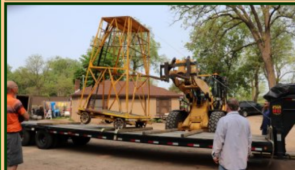
The forklift is gently easing the tower wagon onto its side on the trailer.