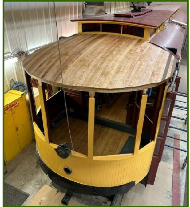
These three photos shows the progress made on the repairs to Duluth No. 265. The Excelsior shop crew has been doing great work getting No. 265 ready to run.