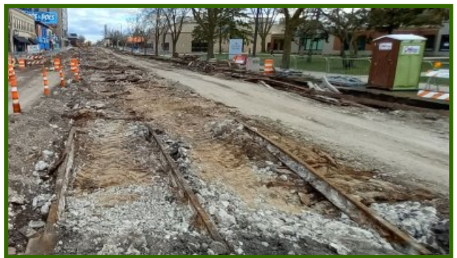
Hennepin Avenue in South Minneapolis is being rebuilt and look what they found. Como-Harriet cars once ran on these rails.