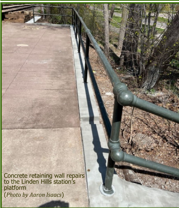
Concrete retaining wall repairs to the Linden Hills station's platform