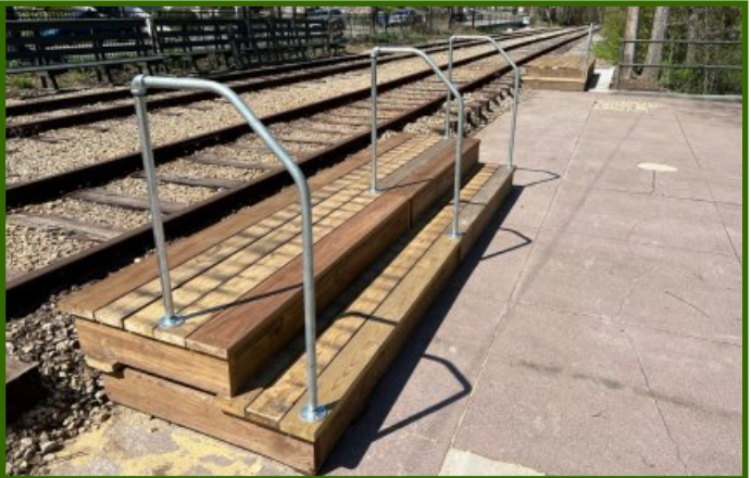
One of the new step boxes on the Linden Hills station platform.