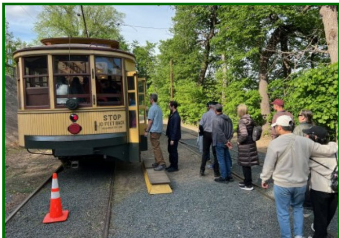
We have a tremendous turnout for Doors Open Minneapolis this year. Here's one group boarding No. 1300 for the return trip to the Linen Hills station.